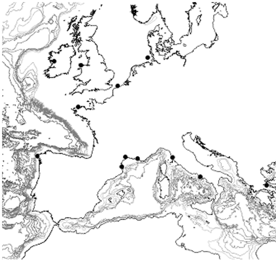
Distribution of Leptosynapta minuta Becher, 1906.

the 1 mm sieve. Perhaps the species can only be found in samples which are fixed before sieving, a procedure not followed for samples taken in coarse sandy areas (VAN HOEY et al., 2004). Meiobenthic samples, on the other hand, are treated with Ludox and centrifuged in order to separate the organisms and the sediment, as described in GIERE (1993). Specimens of L. minuta are probably overlooked with such sampling techniques (except for a single specimen in the study of VAN DAMME & HEIP, 1976) because they (1) cling to the sand grains or (2) have a different specific gravity compared to other meiobenthic taxa (e.g. Nematoda, Copepoda).